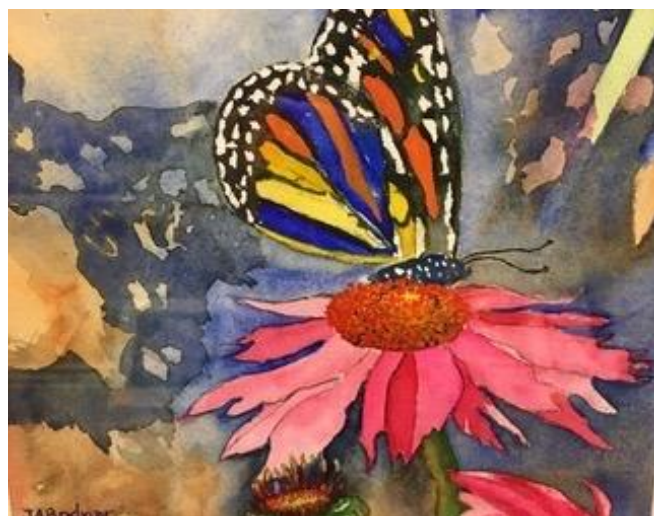
Lunch in the Garden – Joe Bodnar