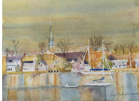
Spa Creek, "On Golden Pond"