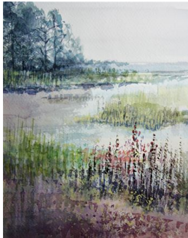
Marsh View by Pam Chase