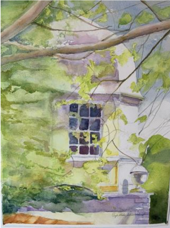
The William Paca Garden Summer House