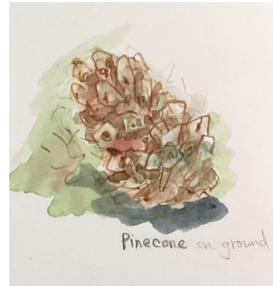
Pine Cone on Ground