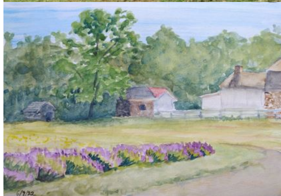
Painting by Liz Grimes 2022

Visit web site for more information: http://historichancocksresolution.org/