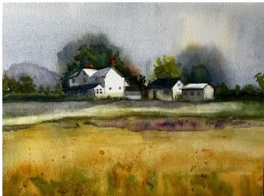
Along Route 50