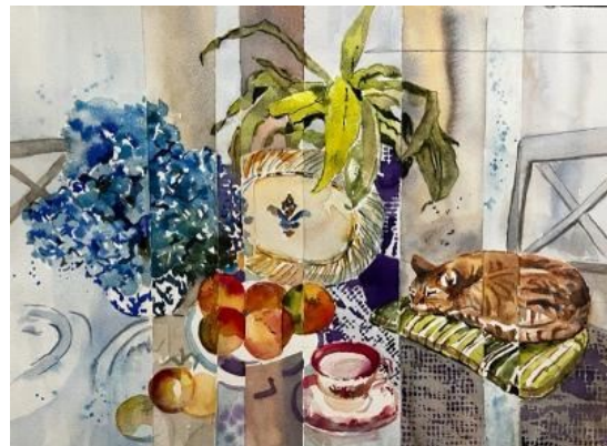
Orange Cat With Peaches